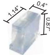
Half Cube 1.14" x 0.4" x 0.87"