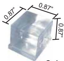
Cube 0.87" x 0.87" x 0.87"