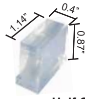
Half Cube 1.14" x 0.4" x 0.87"